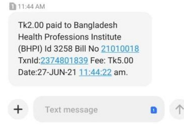
Fig: Confirmation Message