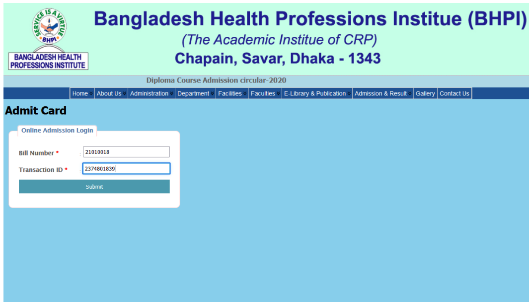
Fig: Admit Card Download Page